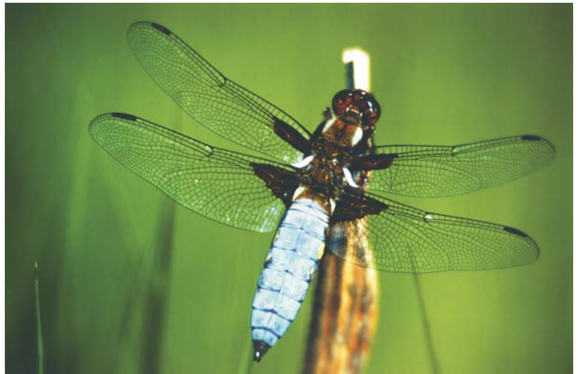
Figure 1: Male dragonfly ( libellula depressa ) resting on a blade of grass.

The local micromechanical properties of different types of dragonfly cuticle were determined from the nanoindentation measurements made with a Hysitron TriboScope ® . Since the insect cuticle is covered with a wax layer, the imaging capability of the microscope is used to position the Berkovich tip onto suitable wax free locations.